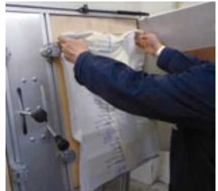
Step 2: The operator places the foam-filled bag in the wooden mold.