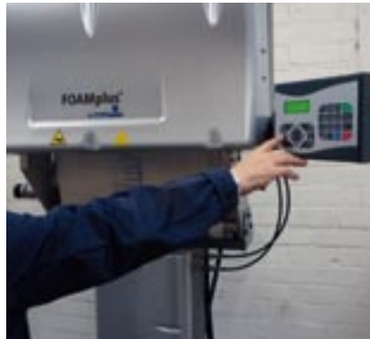
Step 1: The operator chooses a pre-programmed bag setting.