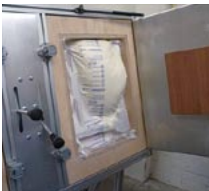
Step 3: The mold is closed to allow the foam to expand inside.