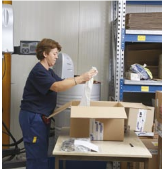
FOAMplus® Bagpacker machine with a single packing table solution.