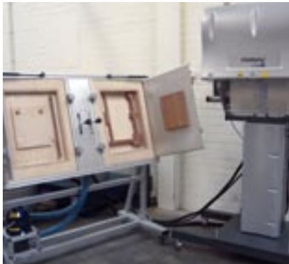
Backpacker machine in combination with the FOAMplus® Dual-Station.