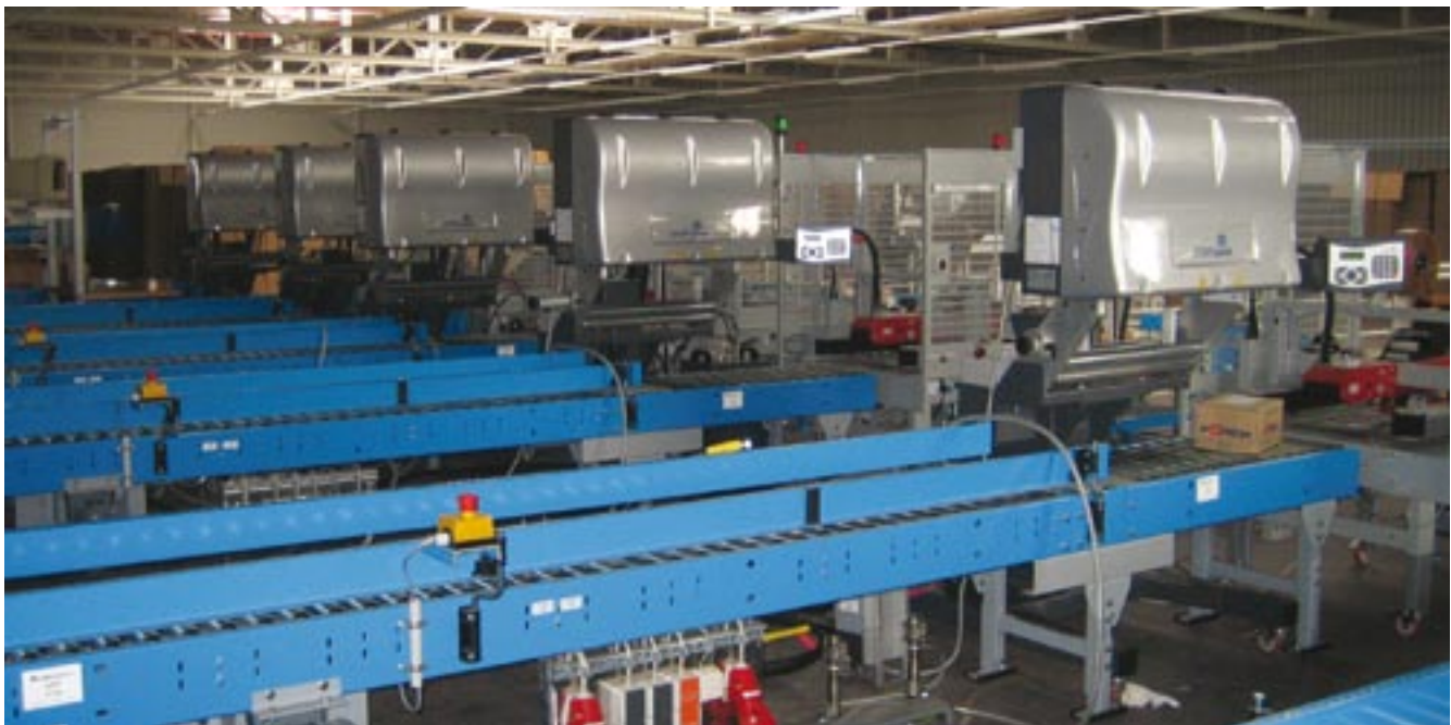
Multiple FOAMplus® Bagpacker machines integrated in a direct conveyor technique.