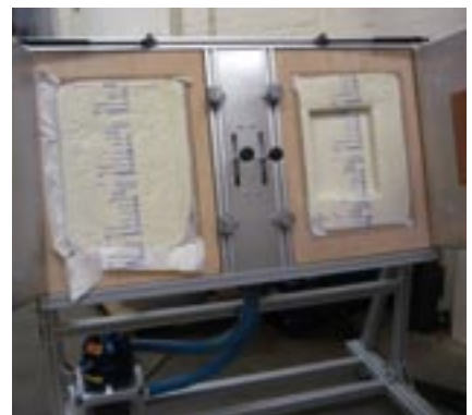
With the FOAMplus® Dual-Station you can quickly make protective cushions for a variety of products.