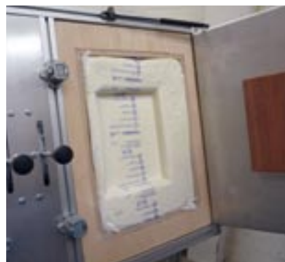
Step 4: After a few seconds the FOAMplus® cushion is ready.