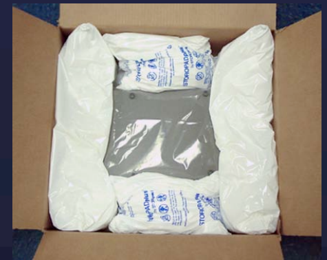
$1,700 Test Unit