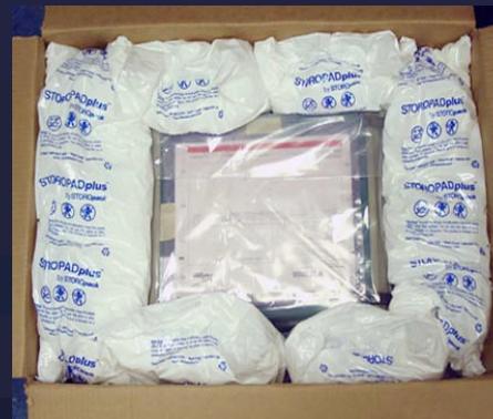
$3,500 Calibration Unit