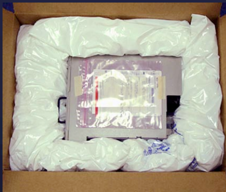
$8,000 Power Supply