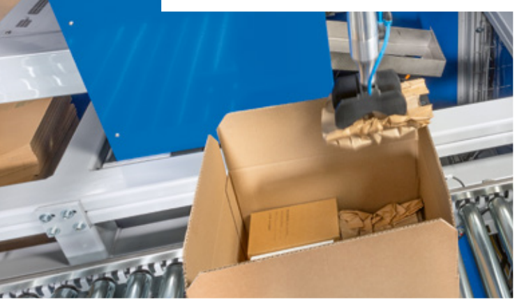
3. THE PROCESS OF INSERTING PROTECTIVE PACKAGING INTO THE BOX IS FULLY AUTOMATED