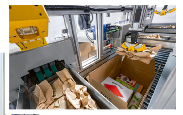
AUTO.PROTECT application with PAPERplus<sup>®</sup> paper pads.