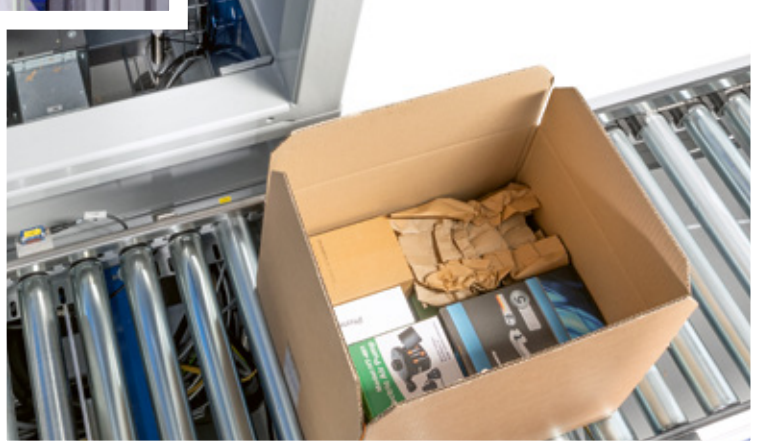
4. WITH THE PRODUCT RELIABLY PROTECTED, THE BOX CAN UNDERGO FURTHER PROCESSING